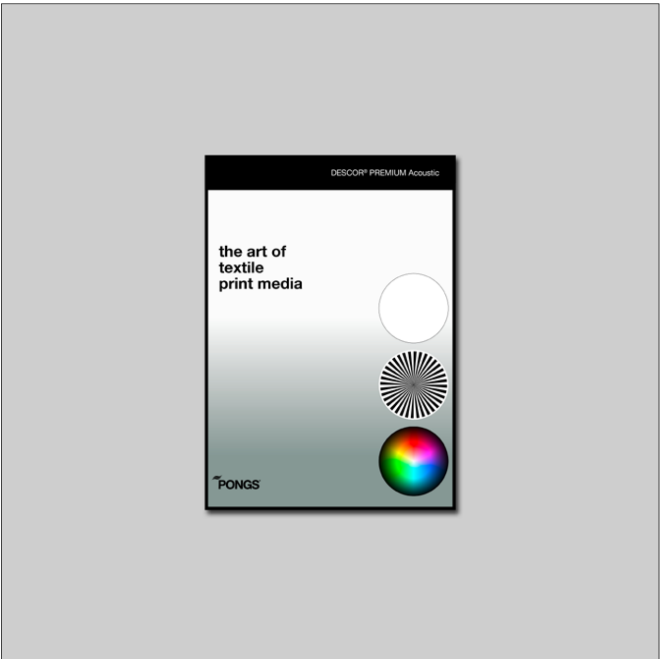
Ref.-Nr.: 699144 085 | Preview print sample